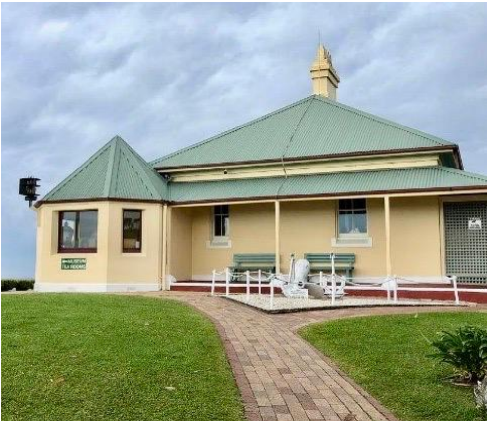
Inner Light cottage

This resolution was carried and the amalgamation process is expected to be completed by mid-August this year.