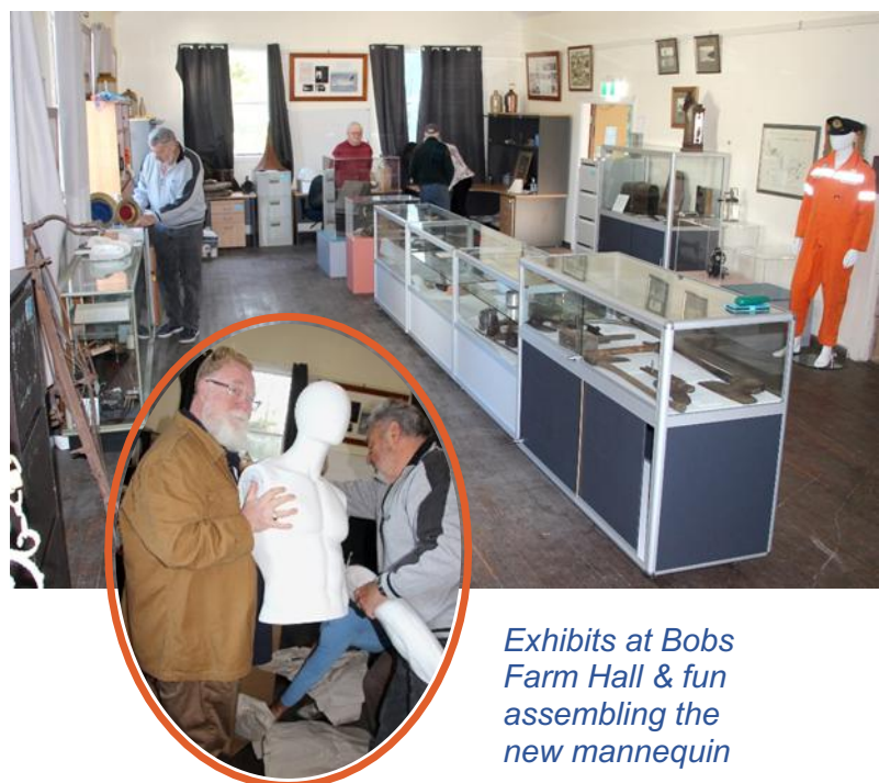
Exhibits at Bobs Farm Hall & fun assembling the new mannequin